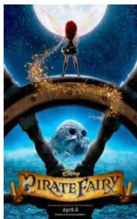
Tinkerbell: The Pirate Fairy