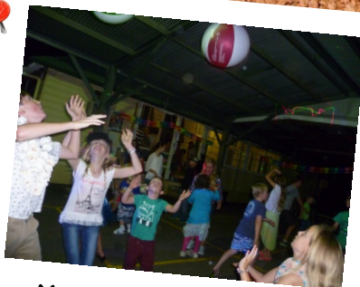
Meet the new families disco