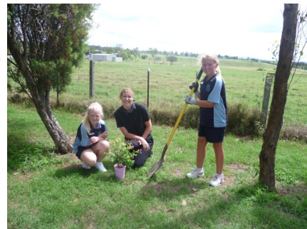
Keep Australia Beautiful