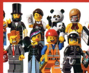
DRESS UP TO WIN!!